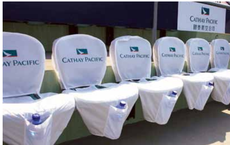
Centre Court VIP Platinum Box