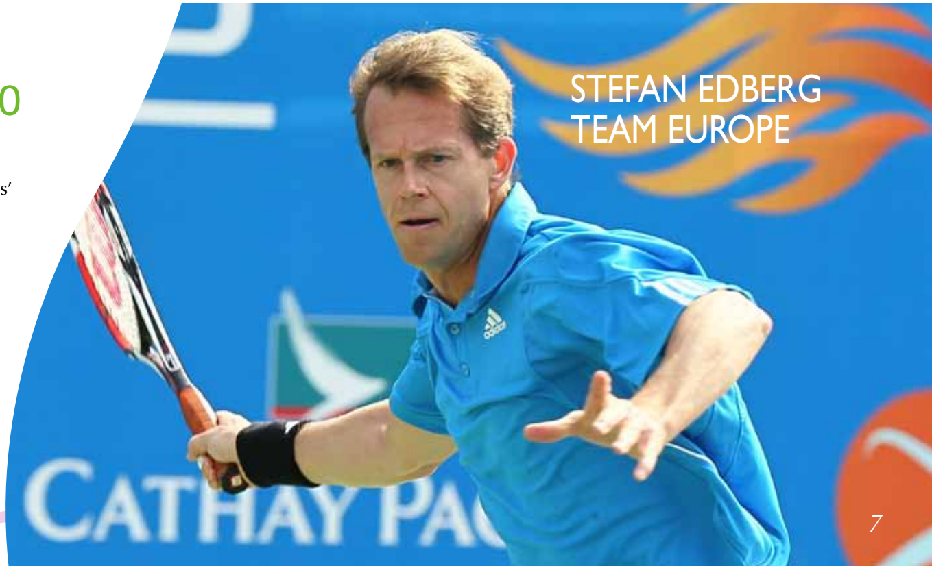
STEFAN EDBERG TEAM EUROPE