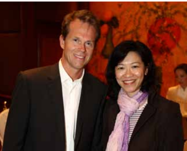
Stefan Edberg with VIP Guest