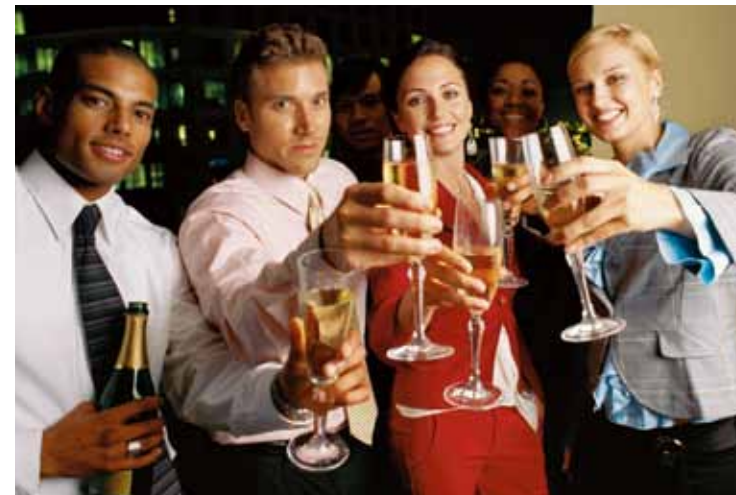
Patrons and their VIP Guests