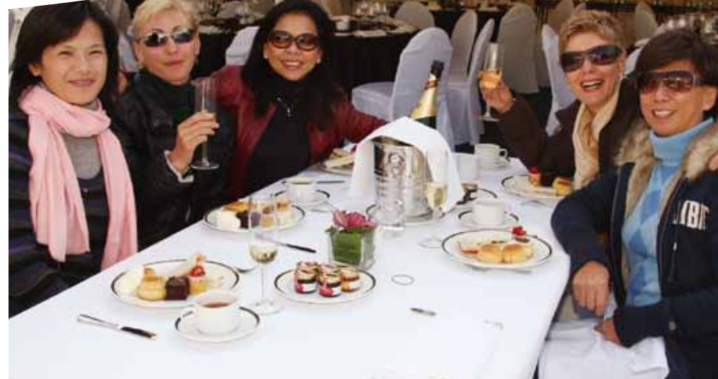
Afternoon Tea and Meet a Player